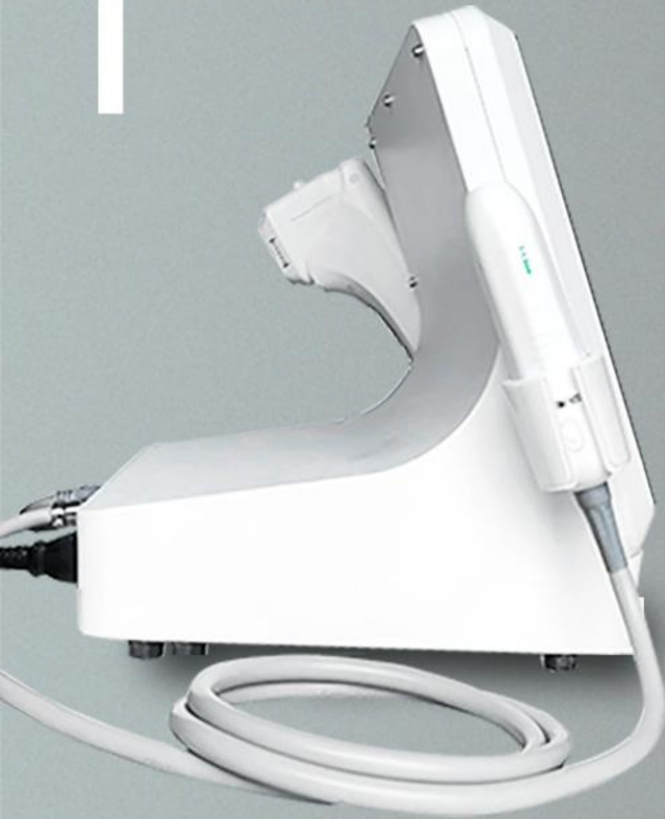
Side of the machine

a beauty machine with multi-function ,non- invasive ,lifting and contouring treatment