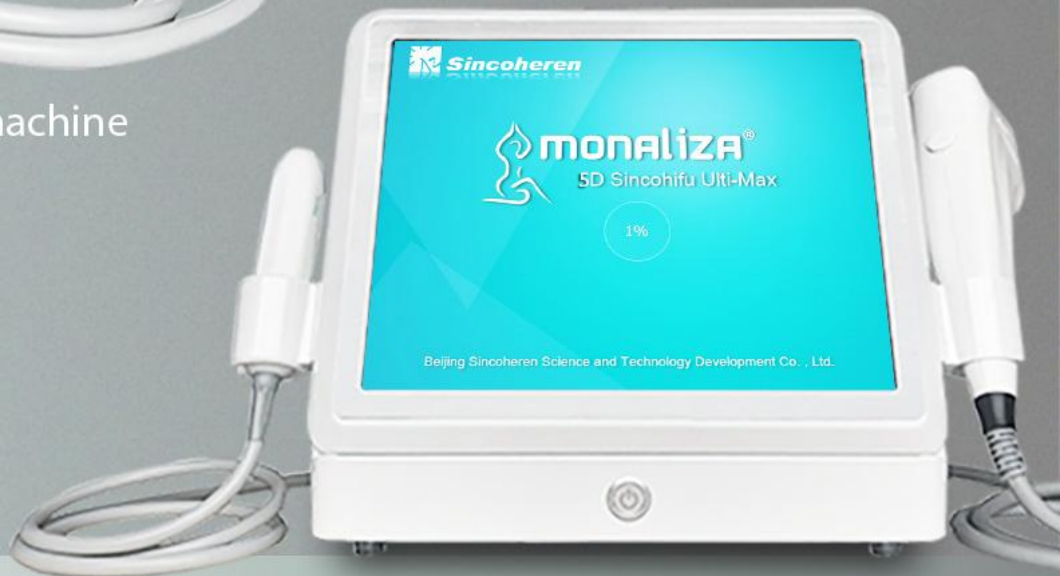
Front of the machine